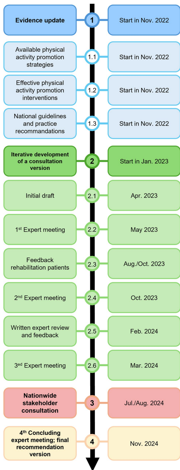
Fig. 1 Timeline and sequence of steps involved in development of the practice recommendations for physical activity promotion in movement-based therapies

were extracted and categorized according to the cybernetic therapy process model by Werle et al. [34], assigning content to the domains of assessment, therapy goals, content, implementation, and evaluation. The analysis of national guidelines and practice recommendations (Step 1.3), followed a structured approach but was not pre-registered. Findings from the evidence update informed the subsequent development of the recommendations by identifying relevant intervention components and implementation gaps. Not all intervention elements and behaviour change techniques identified were translated into explicit recommendations or tables. Instead, components were synthesised based on their relevance for the three competence facets of the PAHCO model (movement competence, control competence, and self-regulation competence), as well as their feasibility and applicability within movement-based therapy in medical rehabilitation. Identified implementation gaps and heterogeneity in current practice (regarding interdisciplinarity, patient-centeredness, the application of theory- and evidence-based biopsychosocial therapy concepts, and the degree of manualisation and standardisation) [28] were used to prioritise recommendation topics and to inform how intervention components should address and combine these competence facets. These evidence-informed inputs formed the basis for the subsequent co-design and consultation processes.