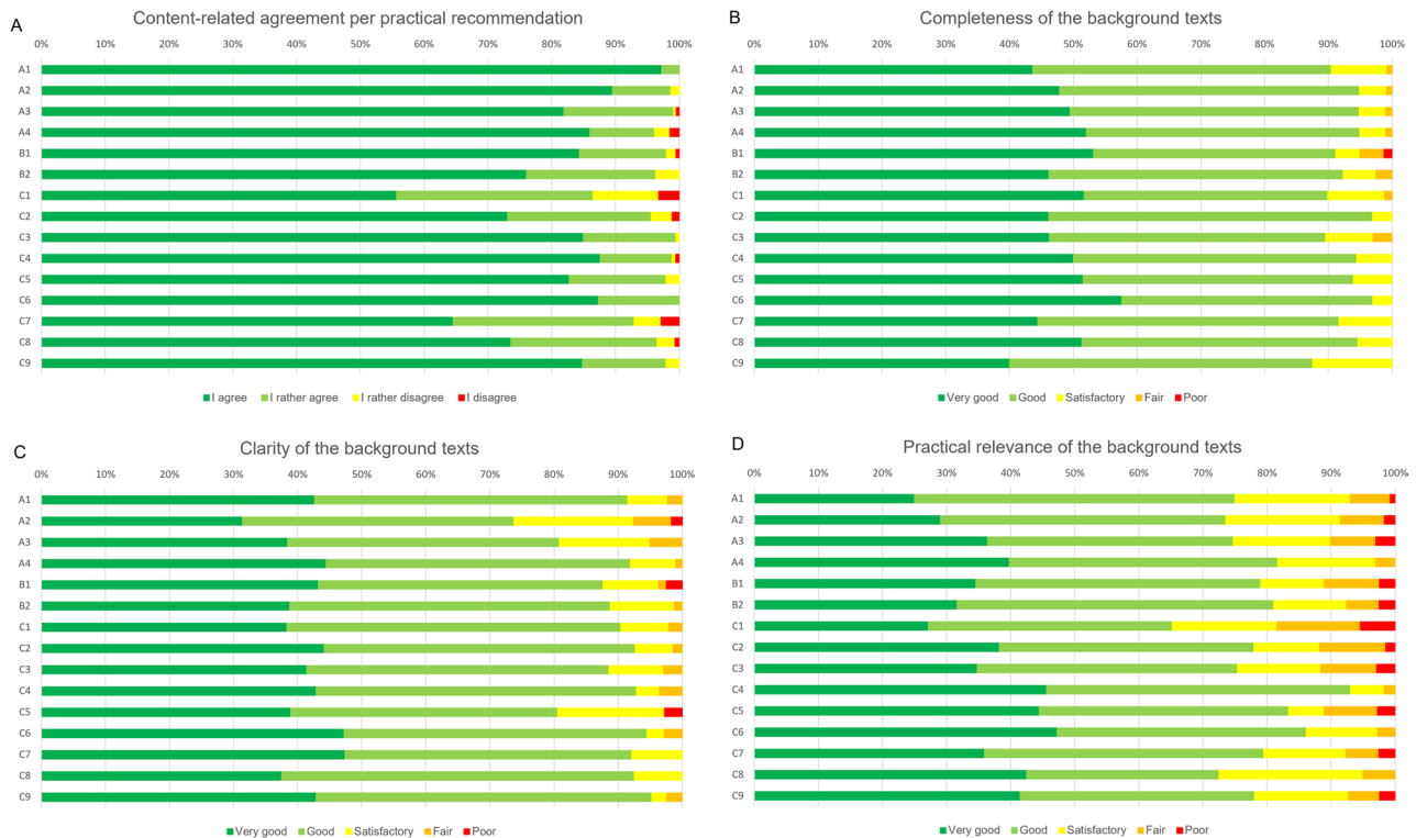
Fig. 2 Results of nationwide consultation of practical recommendations and background texts

to C1 ( Assessment ). Participants emphasized the importance of maintaining a standardised, repeated (pre-post) assessment as a benchmark for patient-centred quality assurance. It was agreed that a clearly formulated and binding recommendation would support quality development in this field.